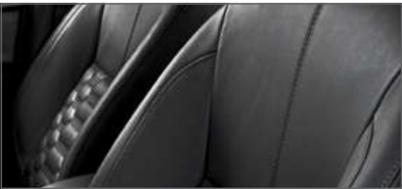
BLACK LEATHER (LE grade)