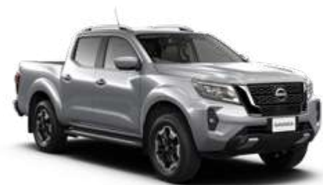
Silver (M) - KYO