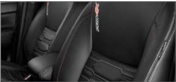
BLACK LEATHER (PRO-4x)