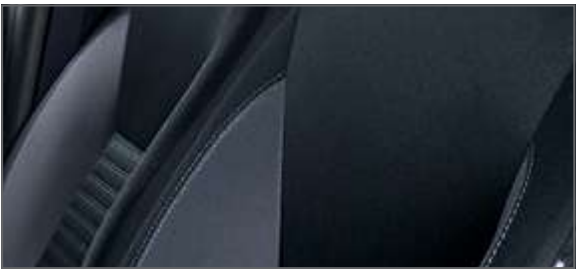
CLOTH (SE and SE Plus grades)

PRO-2X and PRO-4X models are available in White (S) - QM1, Red (S) - AX6, Infinite Black (S) - KH3, and Warrior Grey (PM) - KBY