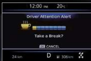
Intelligent Driver Alertness