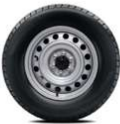
16" STEEL (SINGLE CAB)