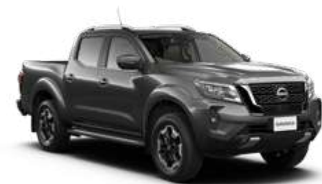
Techno Grey (M) - KY5