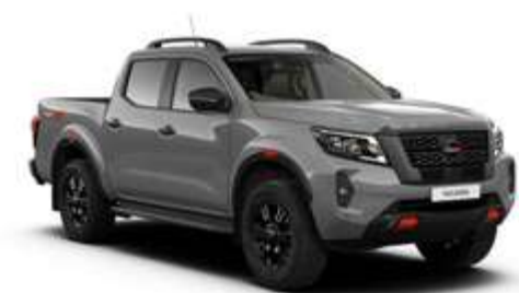
Warrior Grey (PM) - KBY Available on PRO-2X and PRO-4X only

PRO-2X and PRO-4X models are available in White (S) - QM1, Red (S) - AX6, Infinite Black (S) - KH3, and Warrior Grey (PM) - KBY