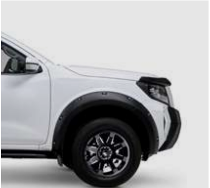
18" ALLOY WHEELS FENDER FLARES