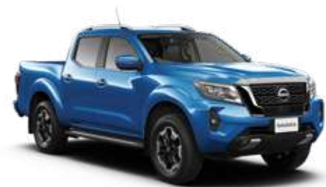
Blue (M) - B16