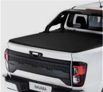
TONNEAU COVER TAIL LAMP SURROUNDS