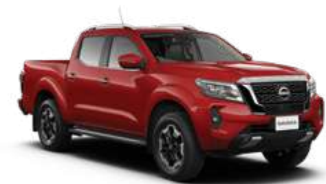
Red (S) - AX6