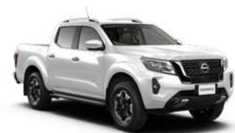
White (S) - QM1