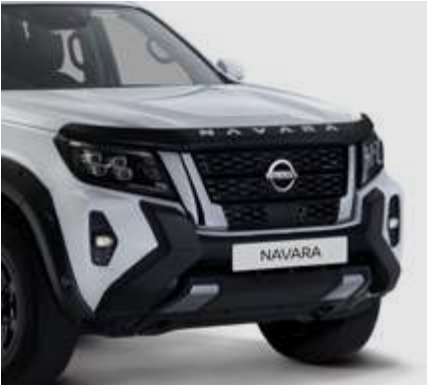
HEAD LAMP SURROUNDS BONNET GUARD