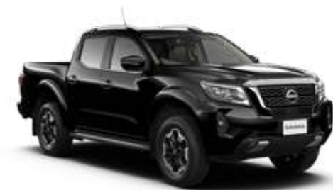
Infinite Black (S) - KH3