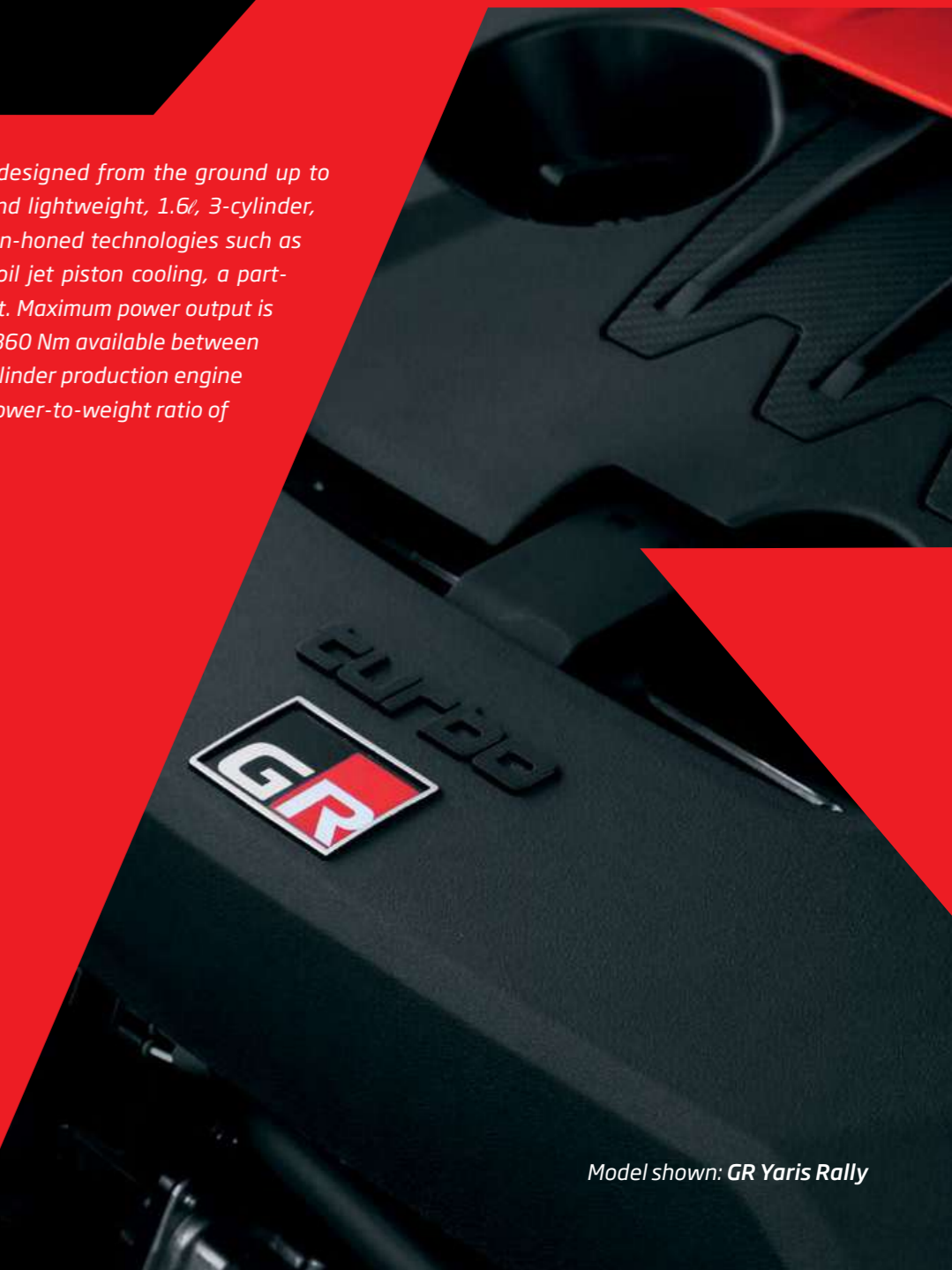
Model shown: GR Yaris Rally

Introducing one of the most powerful production 3-cylinder engines in the world. At Gazoo Racing, we believe that racing improves the breed. That's why Gazoo Racing-enhanced road vehicles like the GR Yaris Rally personify the achievements of Toyota's victories at some of the world's most gruelling motorsport events, such as the Dakar Rally, the 24 hours of Le Mans and the World Rally Championship.