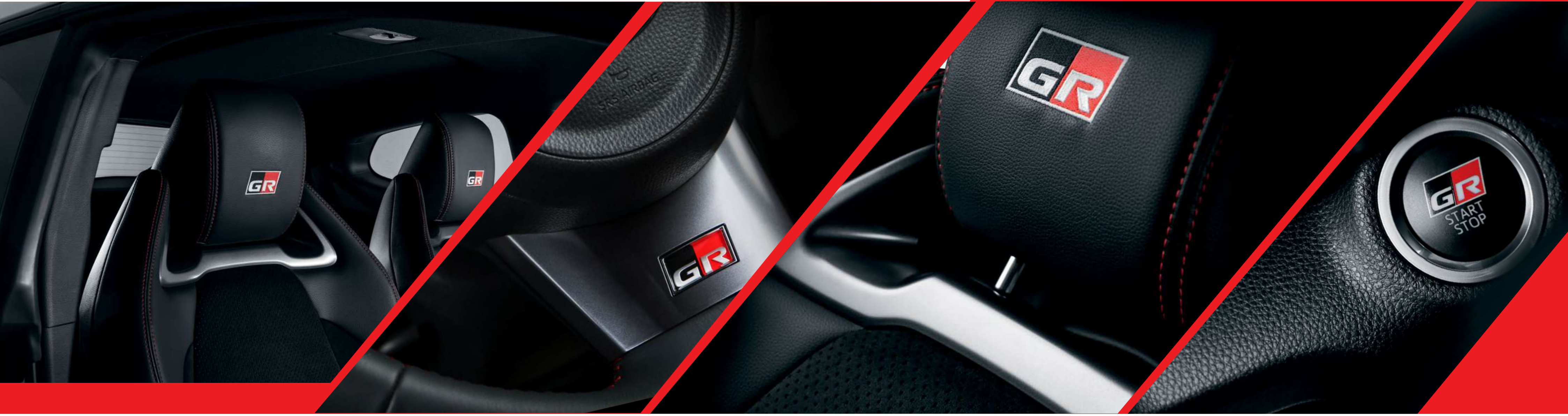
Model shown: GR Yaris Rally