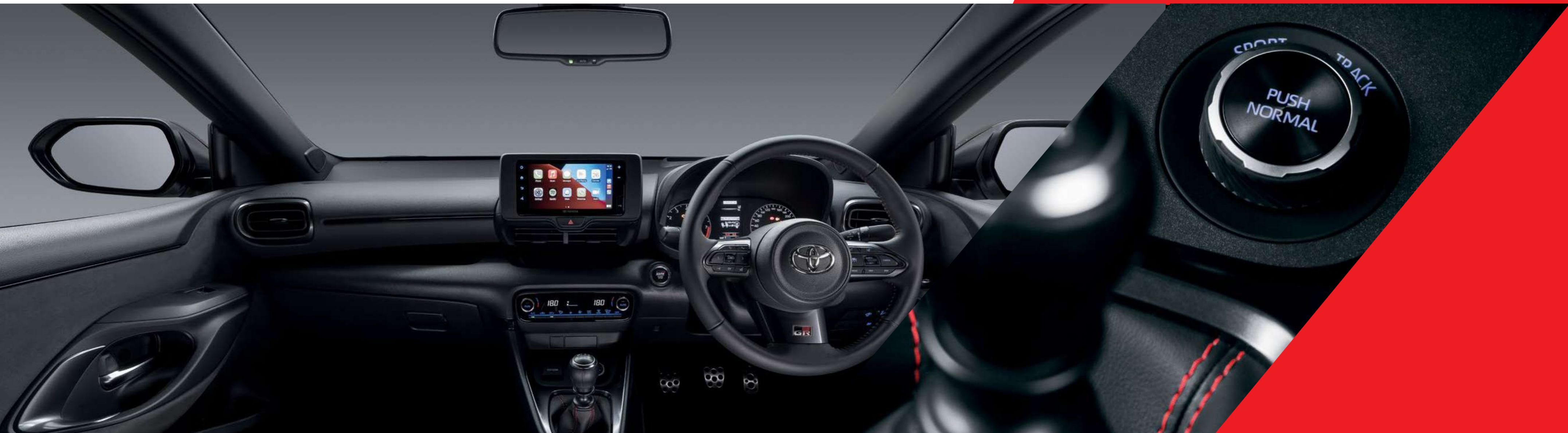
Model shown: GR Yaris Rally