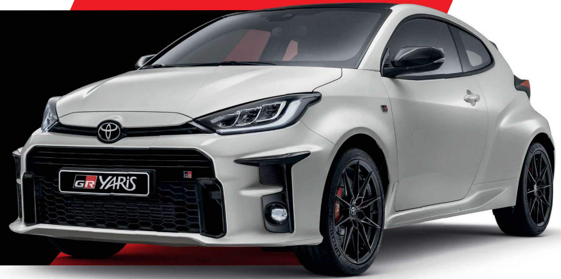
Model shown: GR Yaris Rally