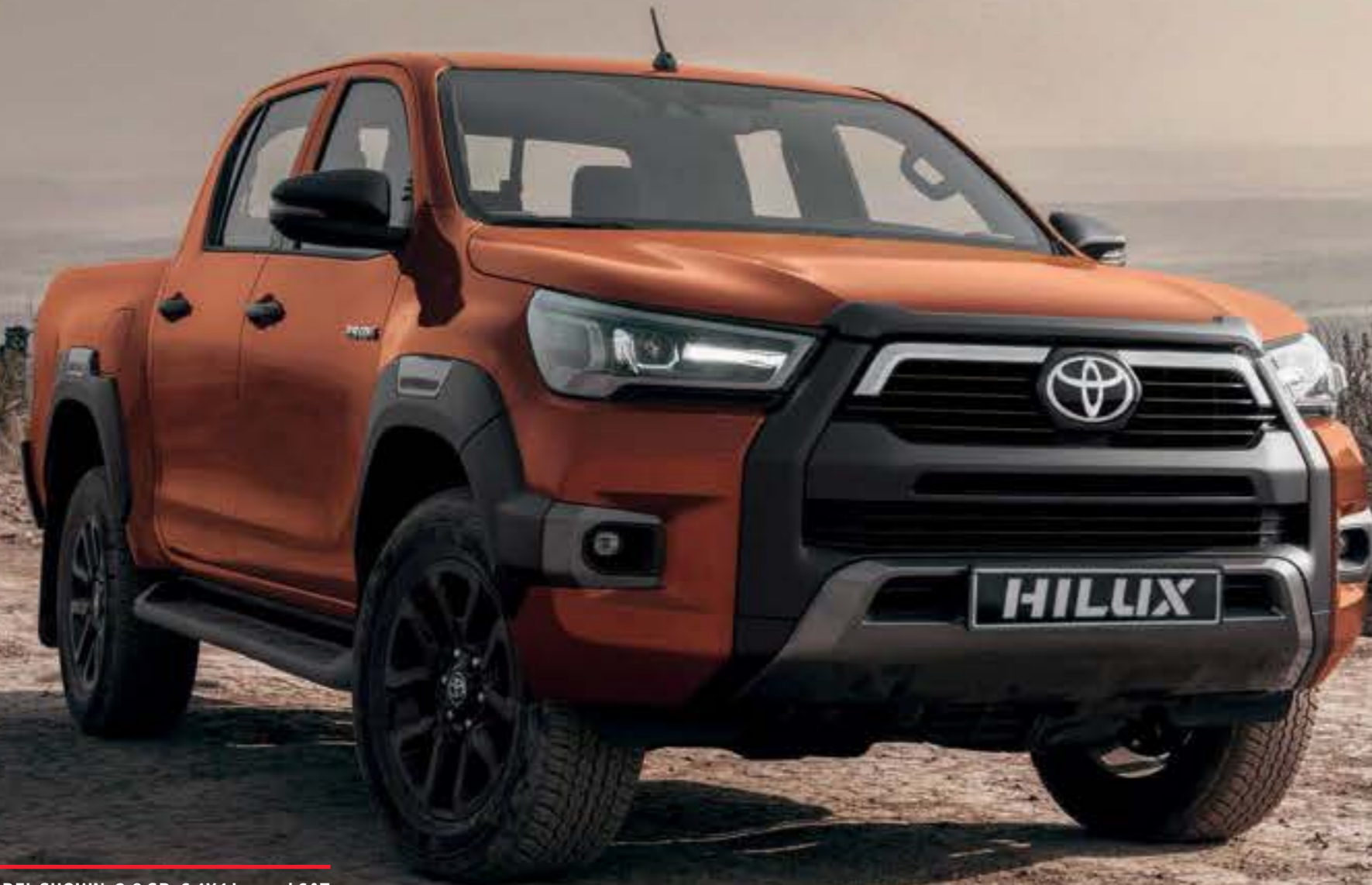
MODEL SHOWN: 2.8 GD-6 4X4 Legend 6AT