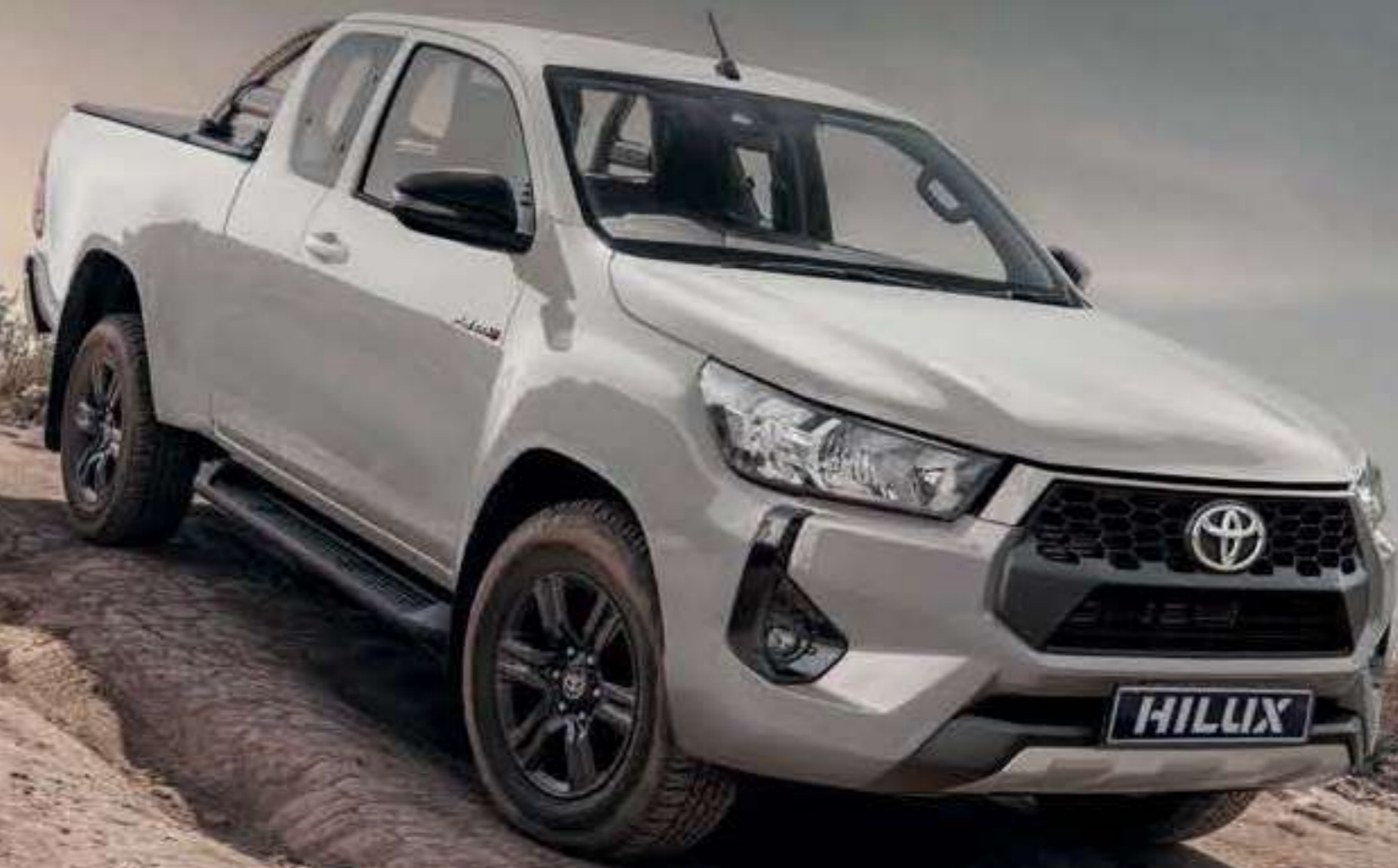
MODEL SHOWN: 2.4 GD-6 Raised Body Raider 6AT