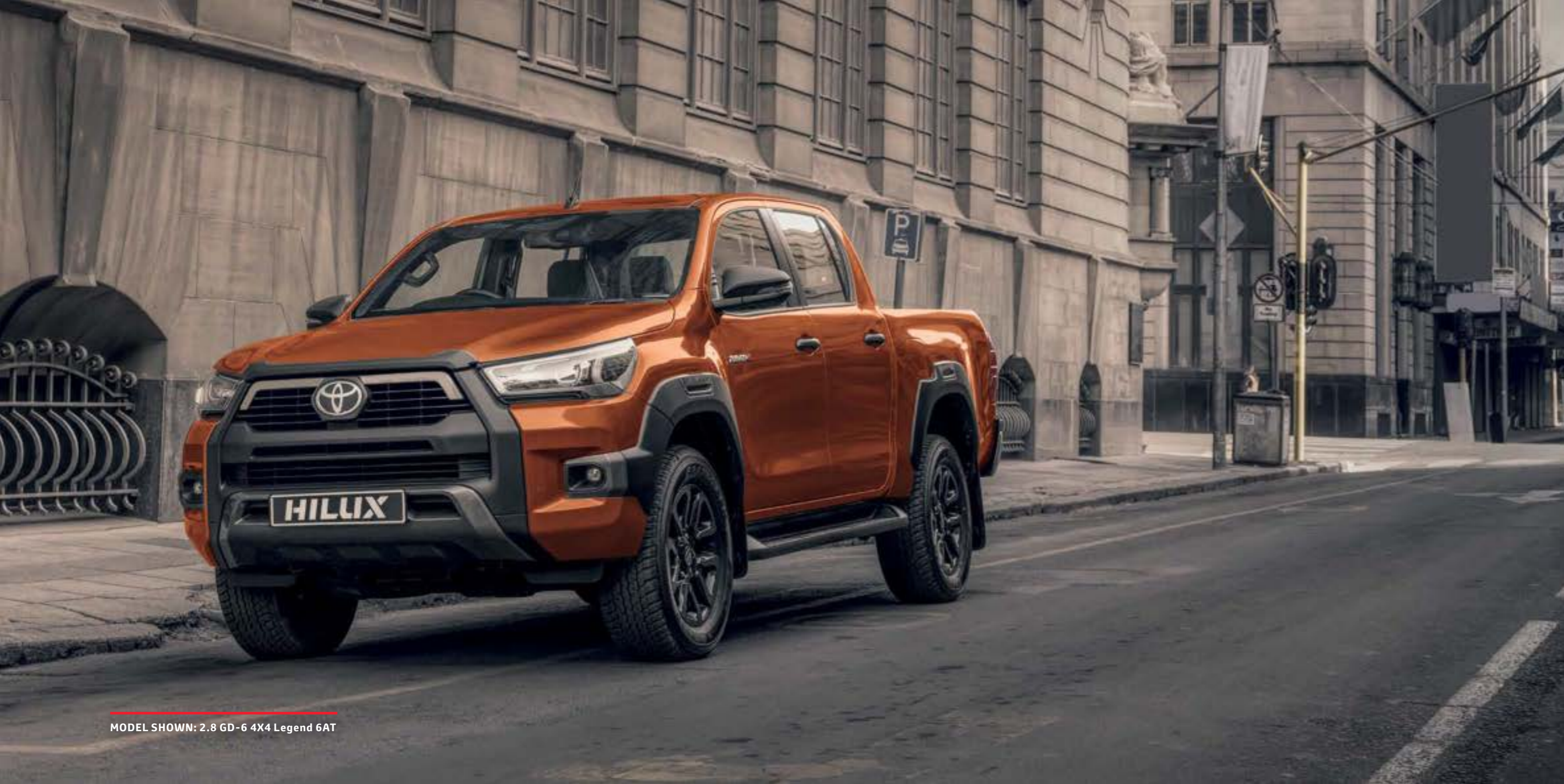
MODEL SHOWN: 2.8 GD-6 4X4 Legend 6AT