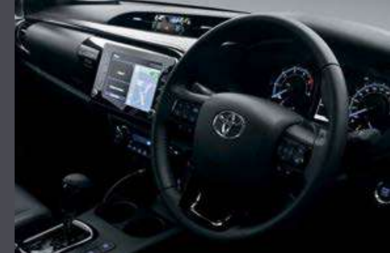
LEATHER-CLAD STEERING WHEEL*