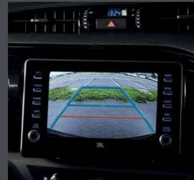
REVERSE CAMERA DISPLAY*