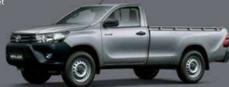
MODEL SHOWN: HILUX 2.4 GD-6 RB SR 6MT

Drivers can look forward to one-touch driver* electric window operation, and air conditioner*.