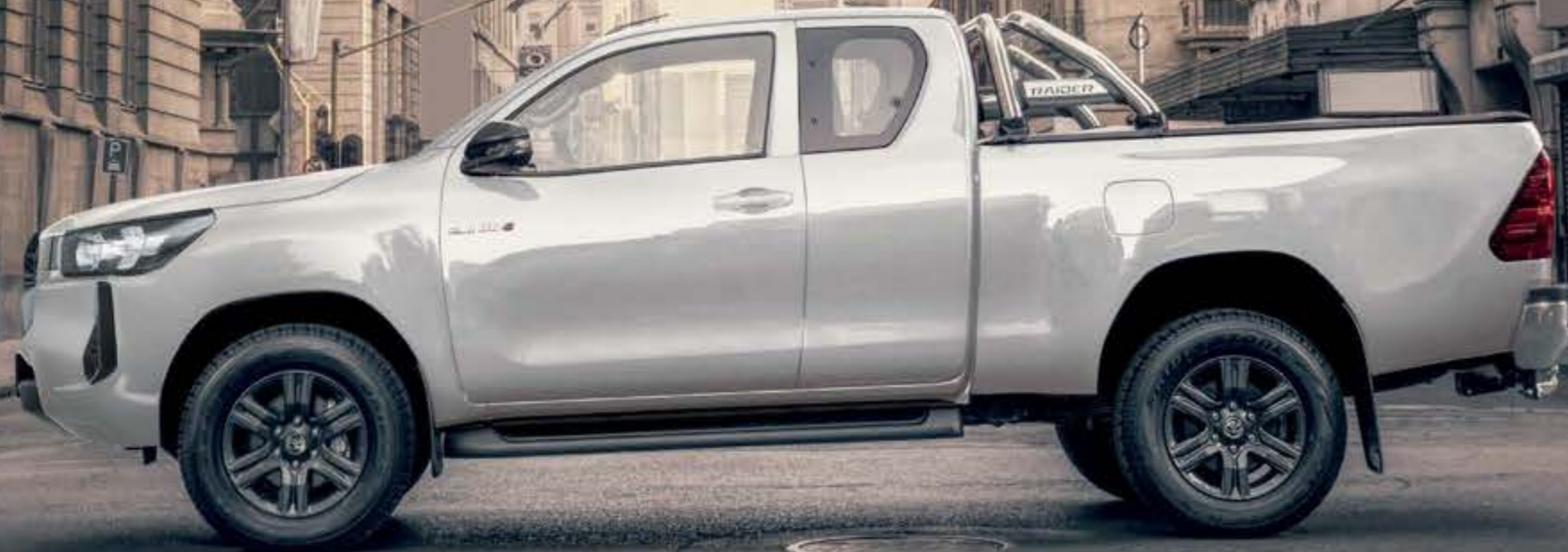
MODEL SHOWN: 2.4 GD-6 Raised Body Raider 6AT

ALL MODELS ARE EQUIPPED WITH ADVANCED BRAKE CONTROL SYSTEMS TO HELP PREVENT ACCIDENTS OR MITIGATE INJURY. THESE INCLUDE: