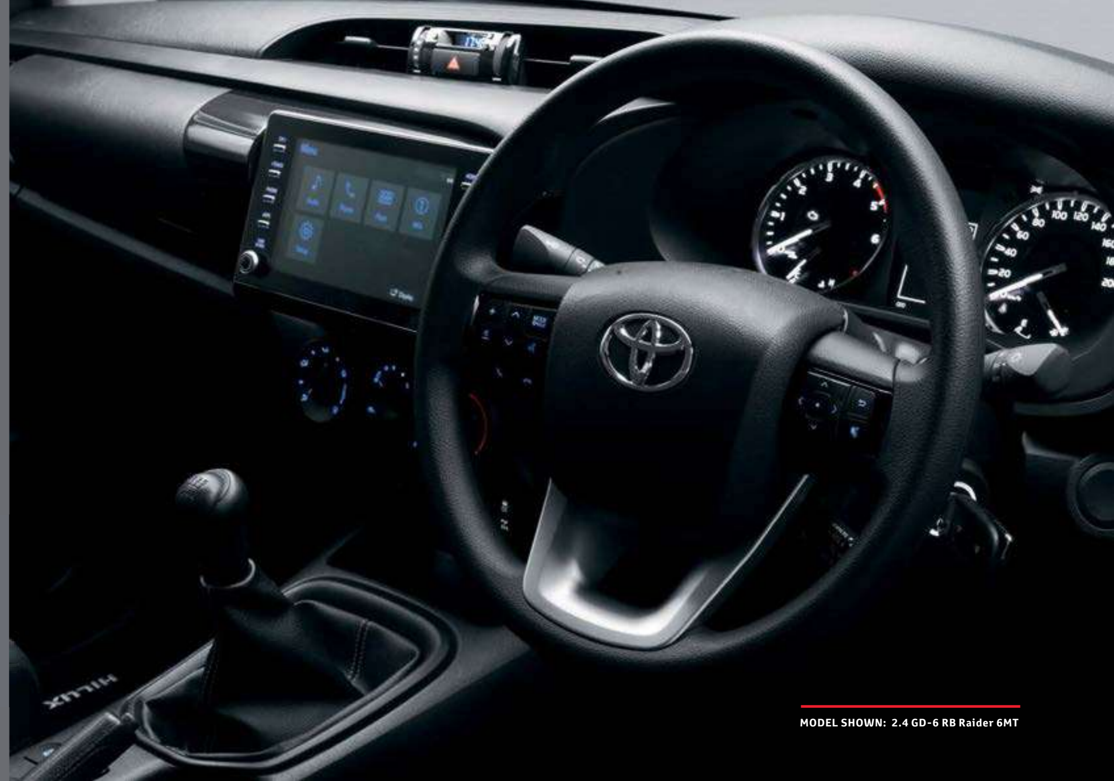
MODEL SHOWN: 2.4 GD-6 RB Raider 6MT