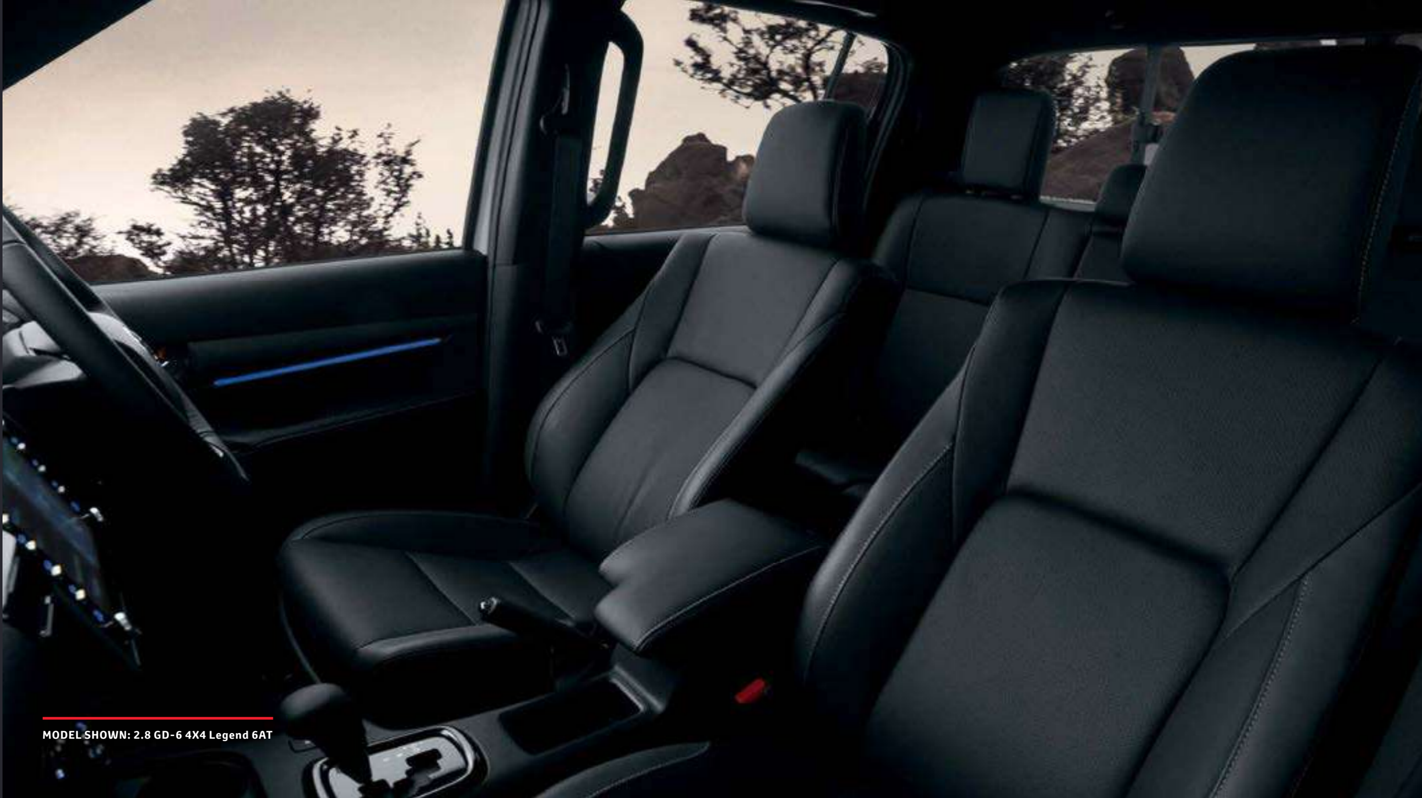
MODEL SHOWN: 2.8 GD-6 4X4 Legend 6AT