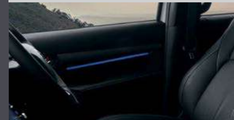
BLUE AMBIENT LIGHTING*