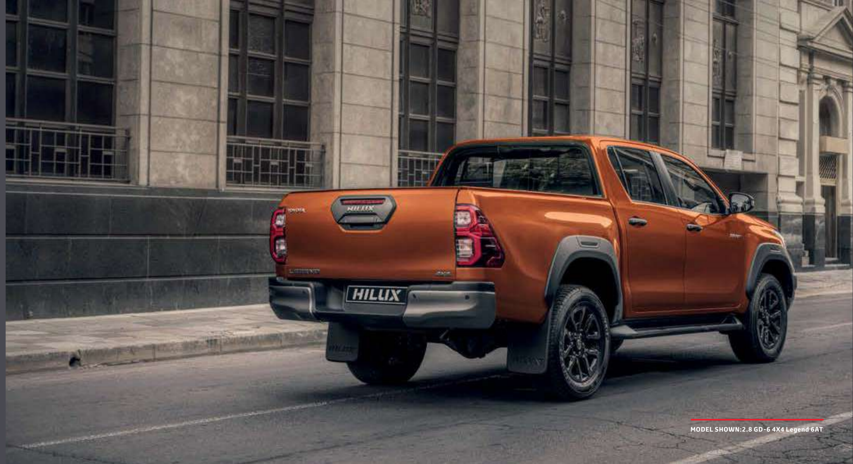
MODEL SHOWN: 2.8 GD-6 4X4 Legend 6AT