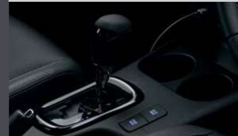
LEATHER-CLAD GEAR SELECTOR*