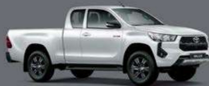
MODEL SHOWN: HILUX 2.4GD-6 RB Raider 6AT

Additionally, the Display Audio infotainment unit has been upgraded to incorporate Apple CarPlay and Android Auto for full smartphone integration with the vehicle's infotainment system.