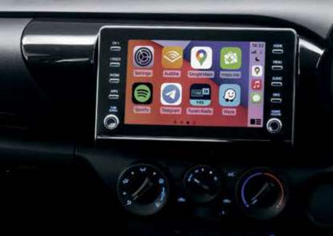
RAIDER: TOUCH SCREEN DISPLAY AUDIO