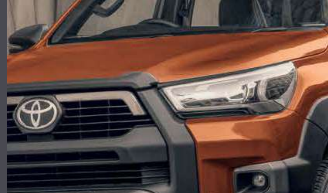
INTEGRATED LED DAYTIME RUNNING LIGHTS (DRL)