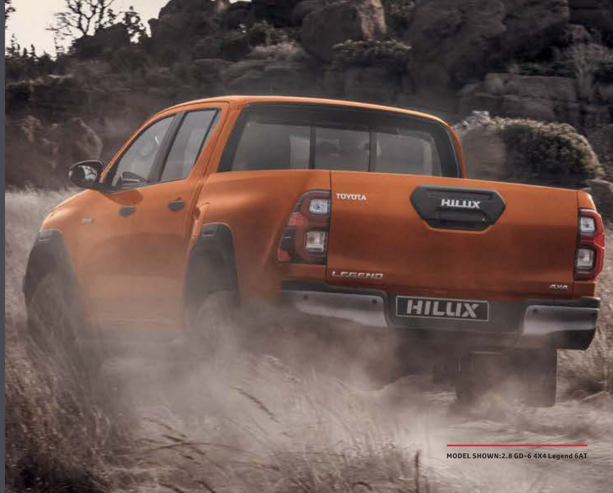
MODEL SHOWN: 2.8 GD-6 4X4 Legend 6AT

LEGENDARY TOUGHNESS REQUIRES LEGENDARY POWER. HELPING YOU WELCOME ANY CHALLENGE IS A RANGE OF PETROL, TURBODIESEL AND 48V ENGINES, FITTED WITH EITHER 5-SPEED OR 6-SPEED MANUAL OR 6-SPEED AUTOMATIC TRANSMISSIONS.