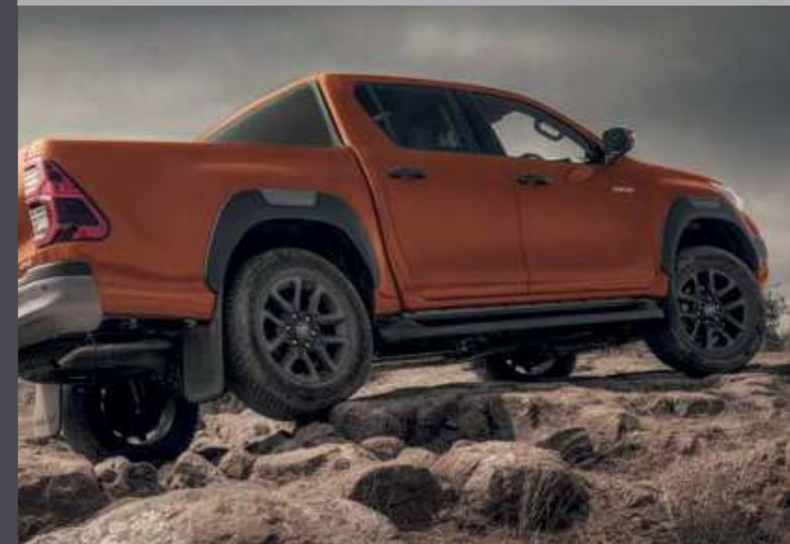
LEGEND BLACK ACCENTS