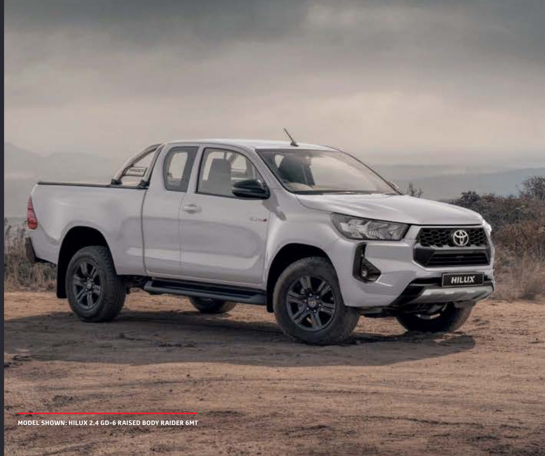
MODEL SHOWN: HILUX 2.4 GD-6 RAISED BODY RAIDER 6MT

NOTHING SHOUTS "BRING IT ON" LIKE A BOLDLY STYLED BAKKIE. BRINGING OUT THE BEST IN THE NEW MODELS – AND YOU – IS AN AGGRESSIVE EXTERIOR PACKAGE THAT CHALLENGES THE STATUS QUO.