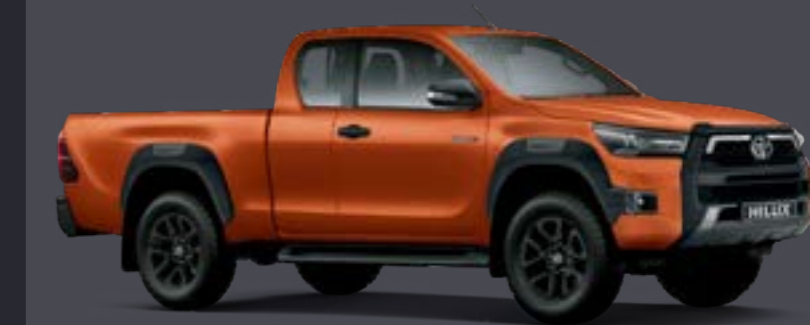
MODEL SHOWN: HILUX 2,8 GD6 4X4 LEGEND 6AT

To enhance the Legend's toughness, an extension to the colour range in Oxide Bronze and Platinum White Pearl has been added.