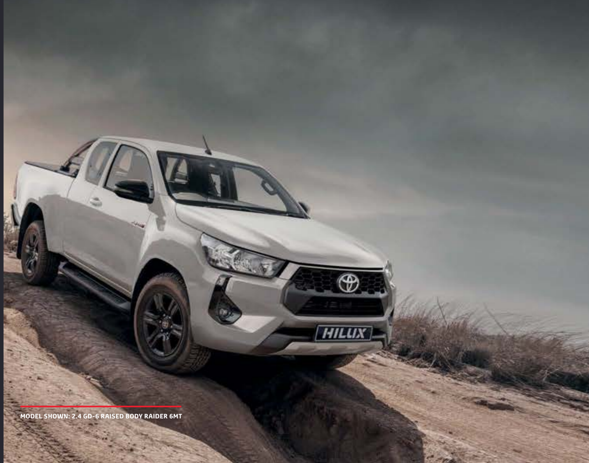
MODEL SHOWN: 2.4 GD-6 RAISED BODY RAIDER 6MT

2.4 GD-6 RAISED BODY RAIDER 6MT 2.4 GD-6 RAISED BODY RAIDER 6AT 2.8 GD-6 RAISED BODY LEGEND 6MT 2.8 GD-6 RAISED BODY LEGEND 6AT 2.8 GD-6 4X4 LEGEND 6MT 2.8 GD-6 4X4 LEGEND 6AT