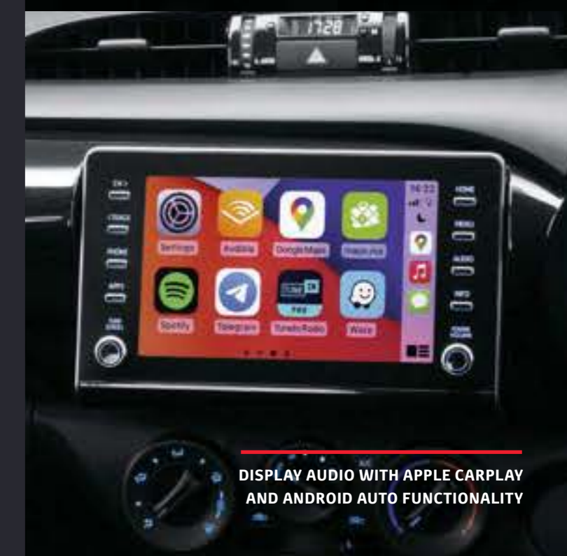
DISPLAY AUDIO WITH APPLE CARPLAY AND ANDROID AUTO FUNCTIONALITY