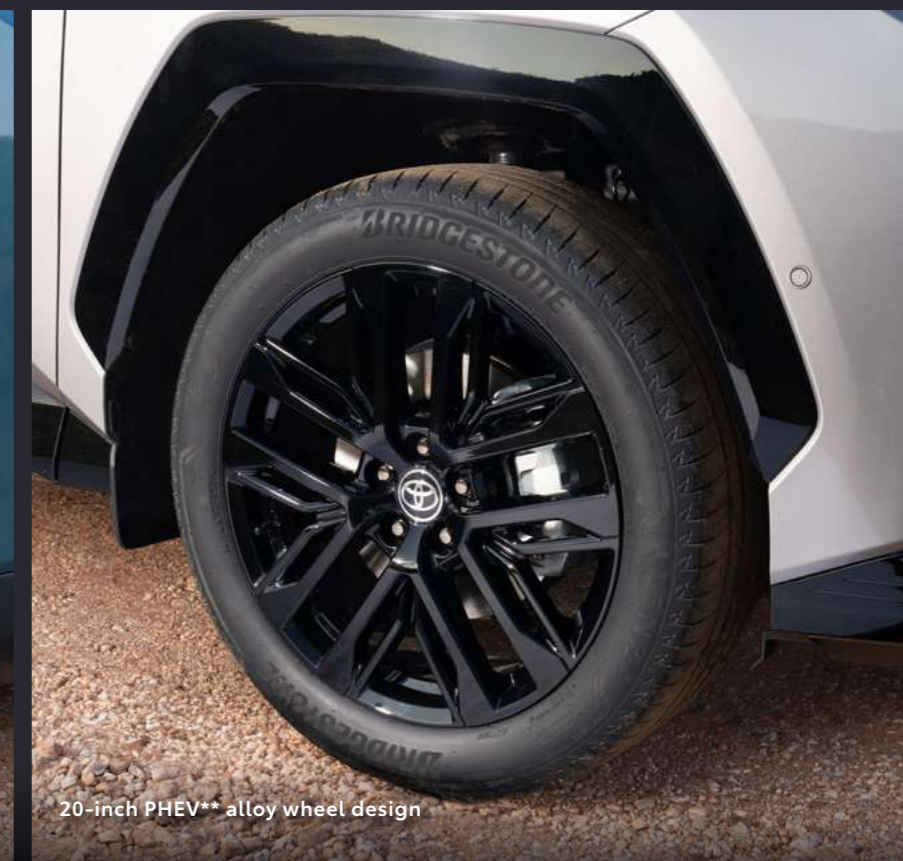
20-inch PHEV** alloy wheel design