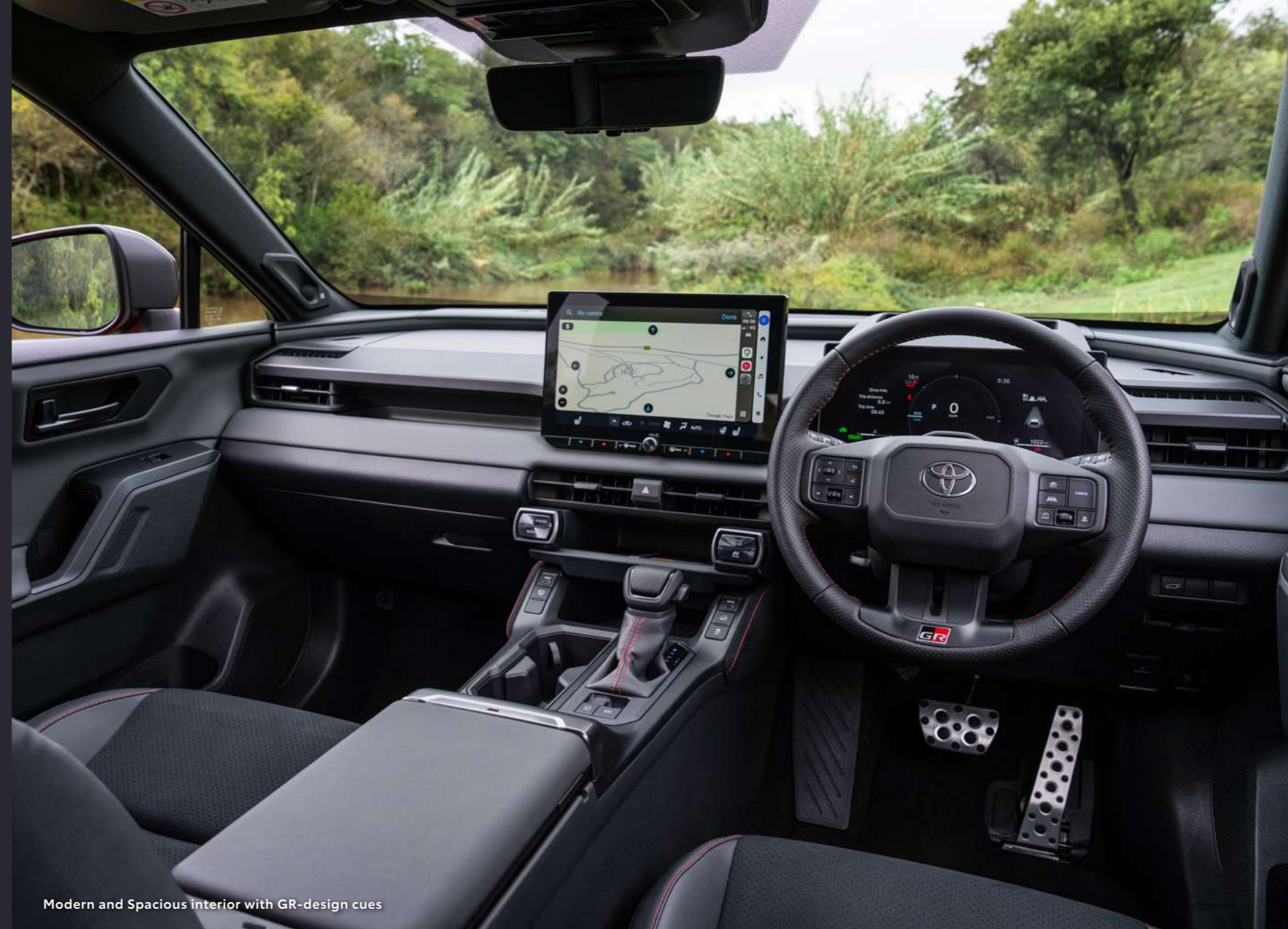
Modern and Spacious Interior with GR-design cues

Heated sports front seats are covered with Ultrasuede® and trimmed with red leather stitching, as are the gear selector and steering wheel (also heated) equipped with shift paddles for a more immersive yet luxurious drive.