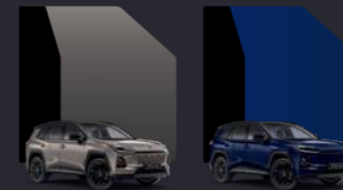
25Q Avant-Garde Bronze Bi-Tone M40 Moonlight Ocean Metallic Bi-Tone