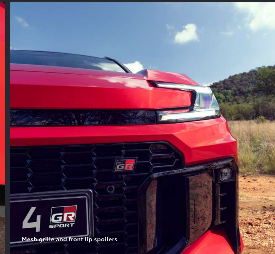
Mesh grille and front lip spoilers