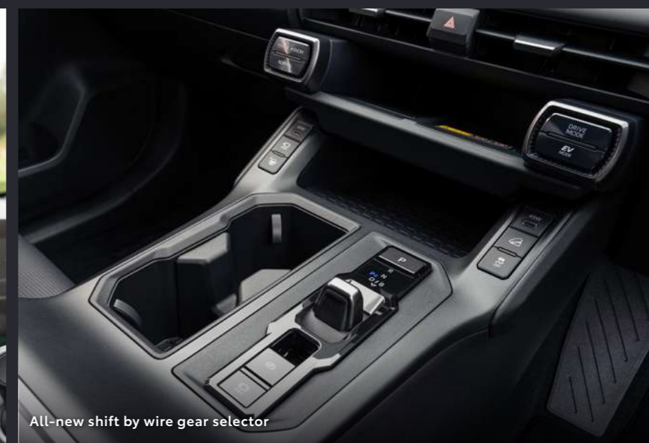
All-new shift by wire gear selector

For a more sophisticated, minimalist interior appearance, the 2.5 HEV VX and 2.5 PHEV** introduce a shift-by-wire turn-dial gear selector. The flagship PHEV** model, makes every journey ultra-comfortable thanks to power adjustable Sport seats and a keyless, foot activated boot.