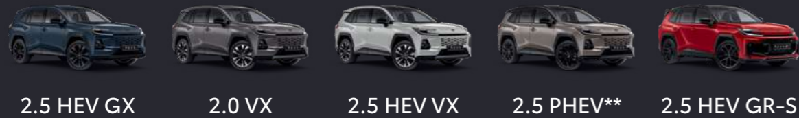
2.5 HEV GX 2.0 VX 2.5 HEV VX 2.5 PHEV** 2.5 HEV GR-S