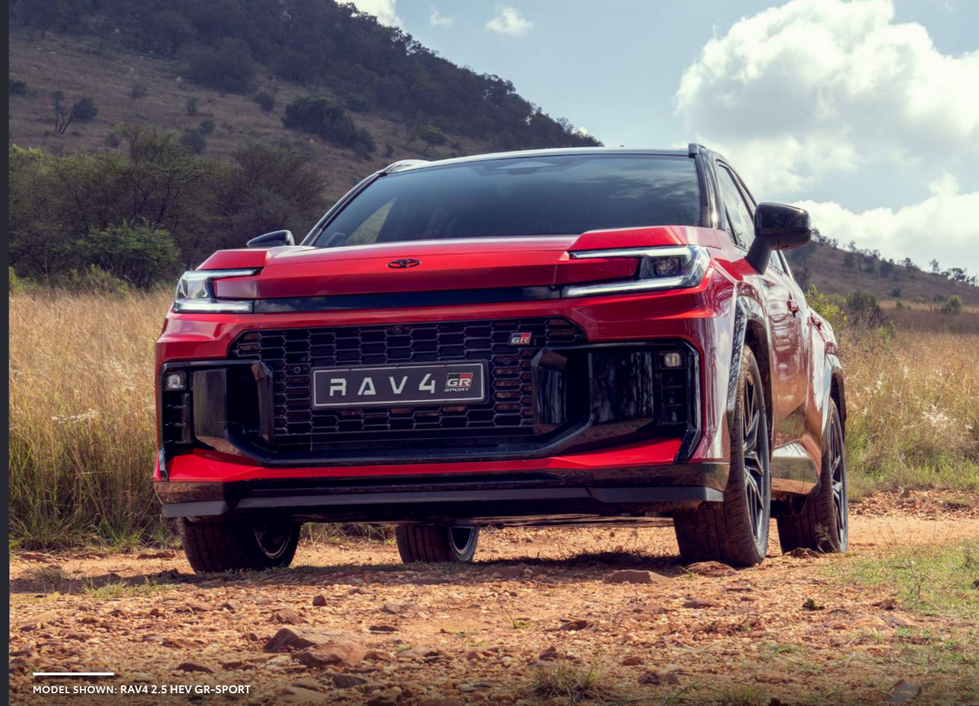
MODEL SHOWN: RAV4 2.5 HEV GR-SPORT

Choose from four bi-tone colours to match your adventurous spirit.