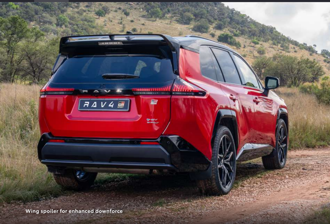
Wing spoiler for enhanced downforce