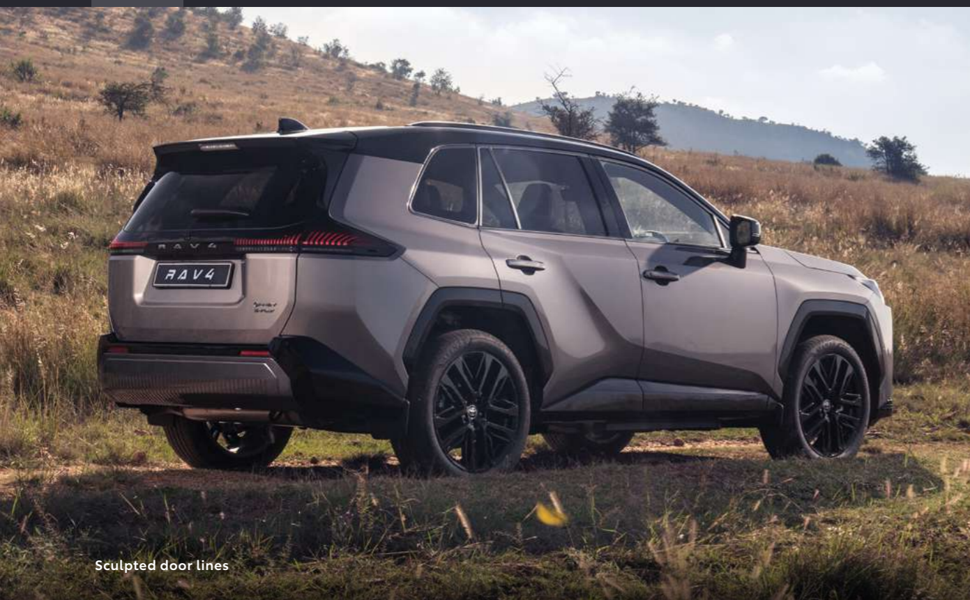
Sculpted door lines