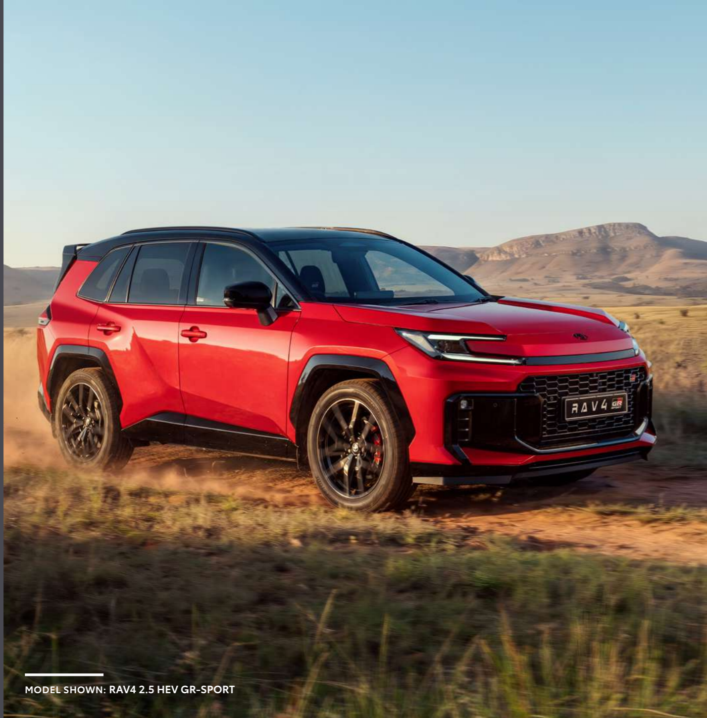
MODEL SHOWN: RAV4 2.5 HEV GR-SPORT