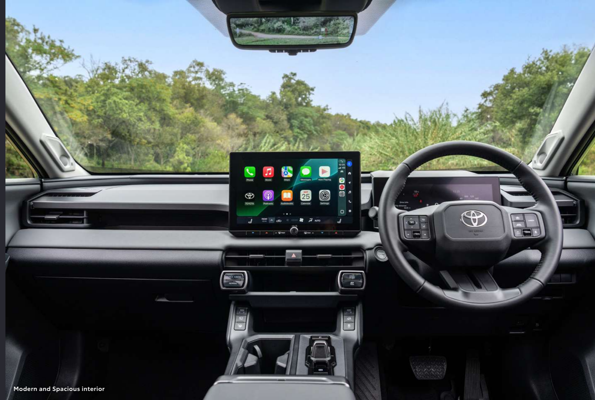
Modern and Spacious interior

*Available in selected models only. **PHEV coming soon.