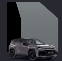
M38 Moon Grey Bi-Tone