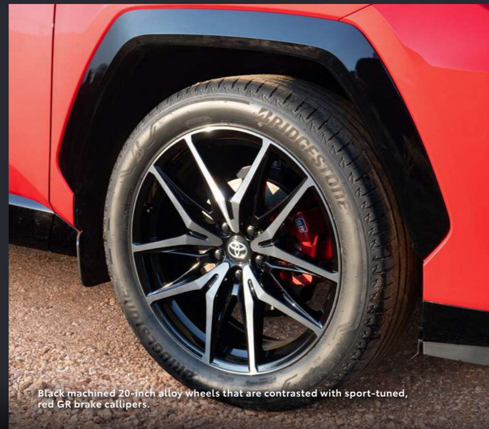
Black machined 20-inch alloy wheels that are contrasted with sport-tuned, red GR brake callipers.