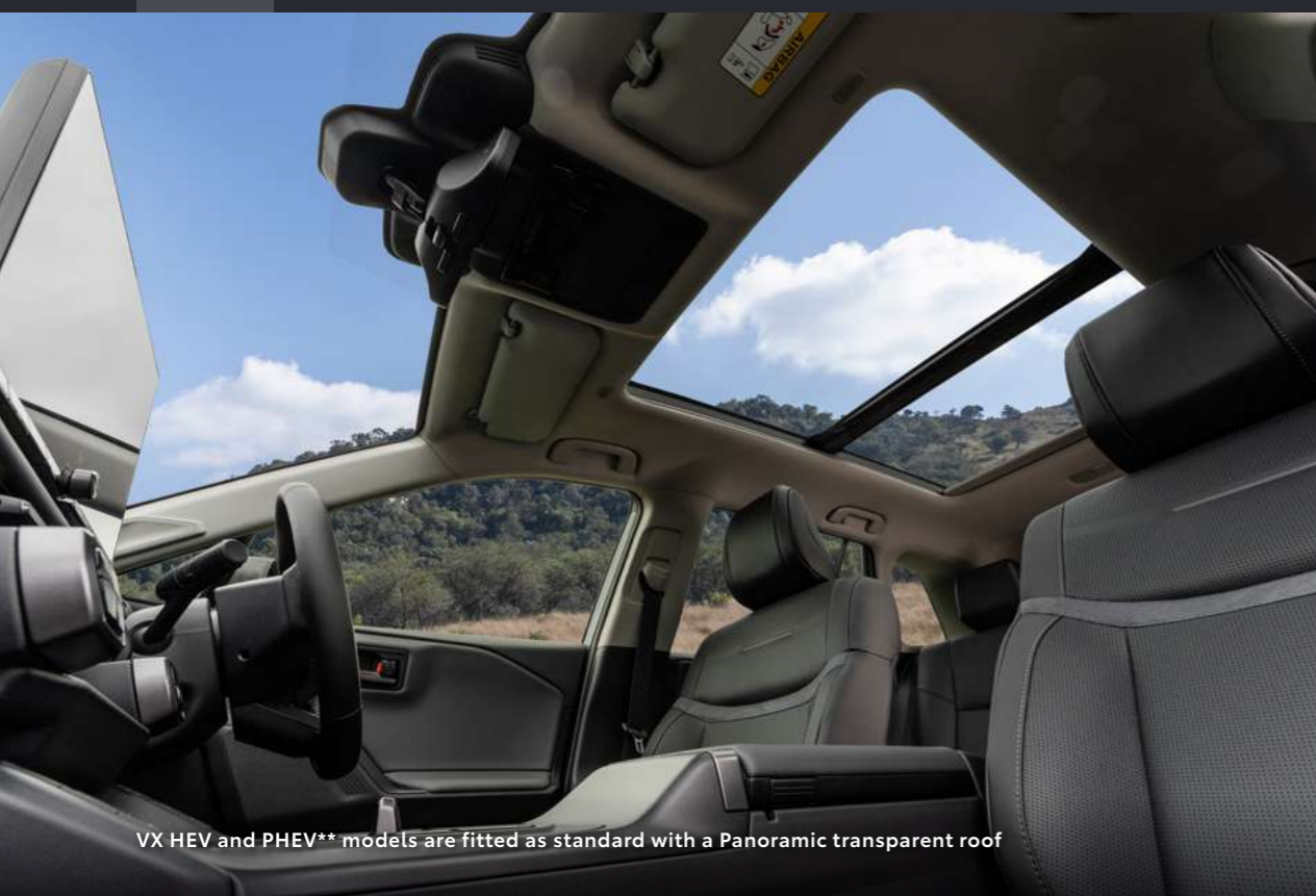
VX HEV and PHEV** models are fitted as standard with a Panoramic transparent roof

Comfort is of the essence with heated and ventilated* front and rear leather seats*, a leather-clad steering wheel*, automatically adjusting day/night rear view mirror, and a heads-up display*.