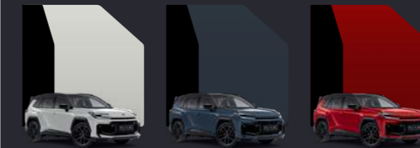
2VP Platinum White Bi-Tone M22 Smokey Blue Bi-Tone 2TB Passion Red Bi-Tone