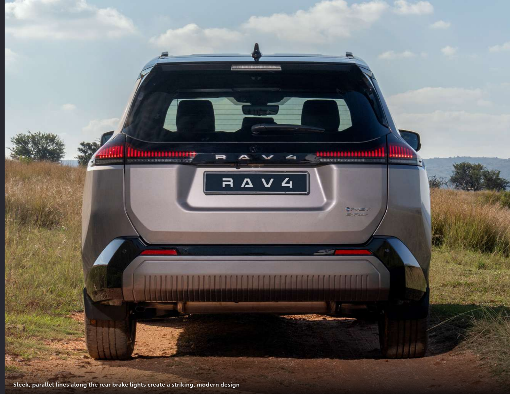
Sleek, parallel lines along the rear brake lights create a striking, modern design

Angular door lines enhance the RAV4's profile, and a bumper design that separates the brake lights create a distinctly futuristic look. GX and VX models sport striking 5-spoke, 18-inch alloy wheels while the flagship PHEV* features a more athletic 20-inch alloy wheel design.