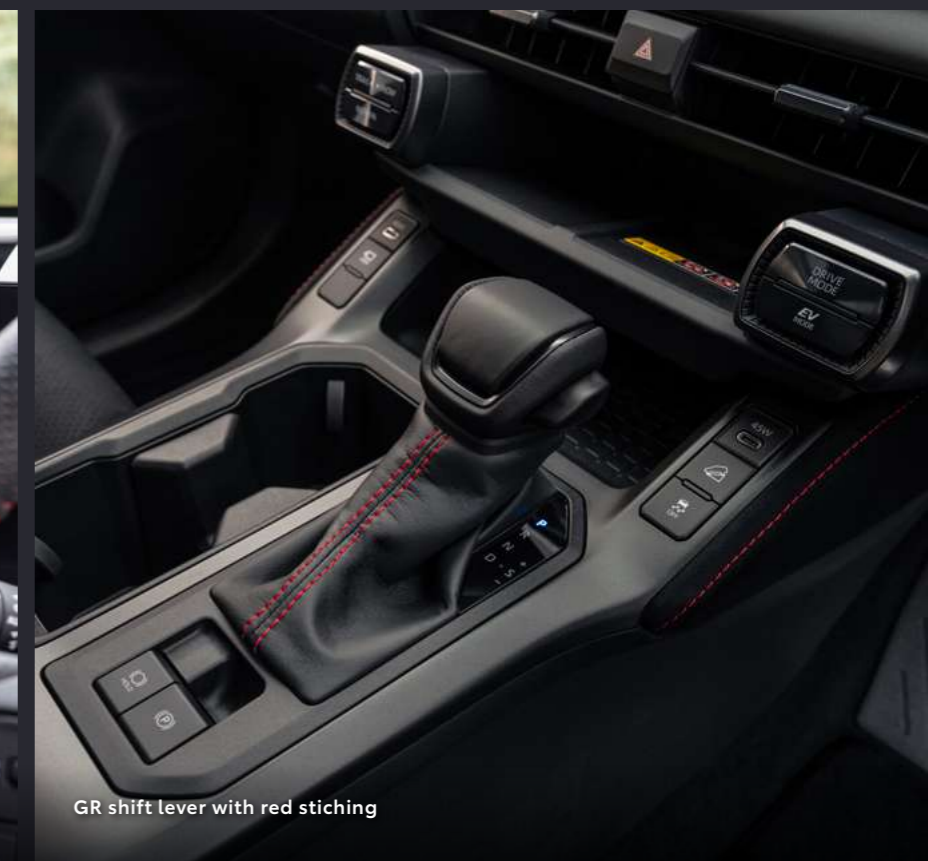
GR shift lever with red stitching