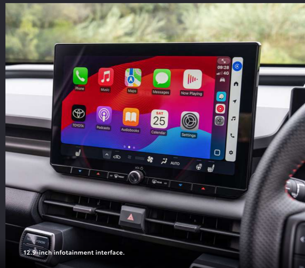
12.9-inch infotainment interface.