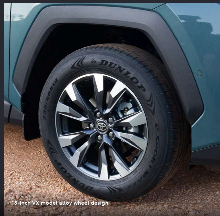
18-inch VX model alloy wheel design