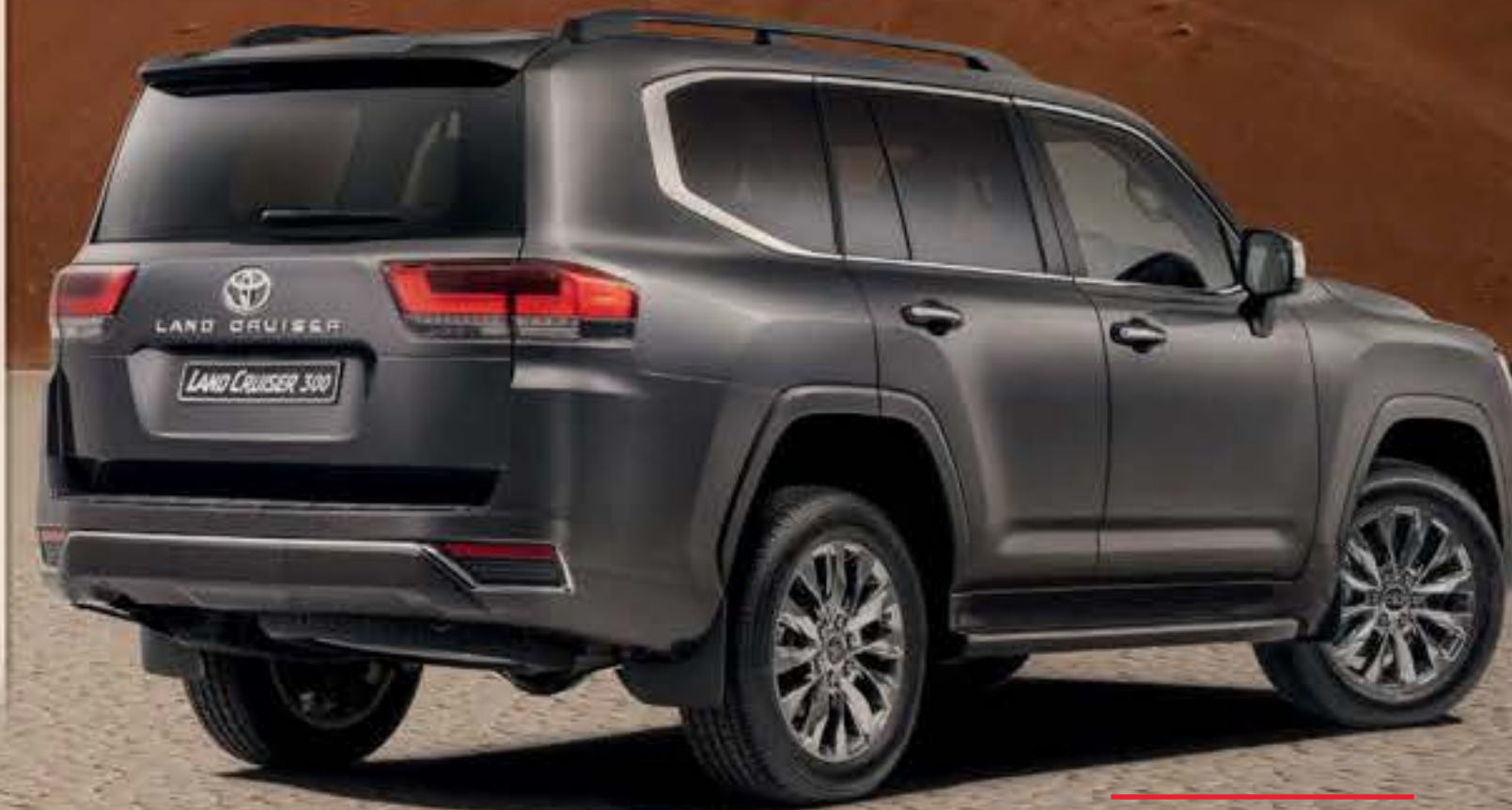
Model Shown: 3.5TV6 ZX

THE WORSE THE ROAD, THE BETTER THE DRIVE.