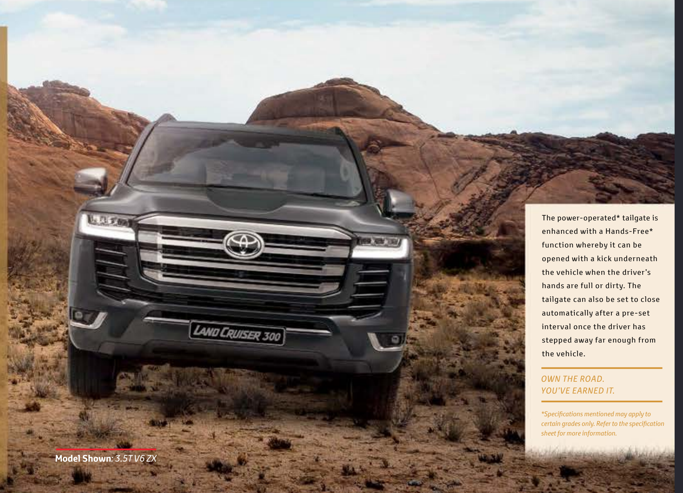
Model Shown: 3.5T V6 ZX

The power-operated* tailgate is enhanced with a Hands-Free* function whereby it can be opened with a kick underneath the vehicle when the driver's hands are full or dirty. The tailgate can also be set to close automatically after a pre-set interval once the driver has stepped away far enough from the vehicle.