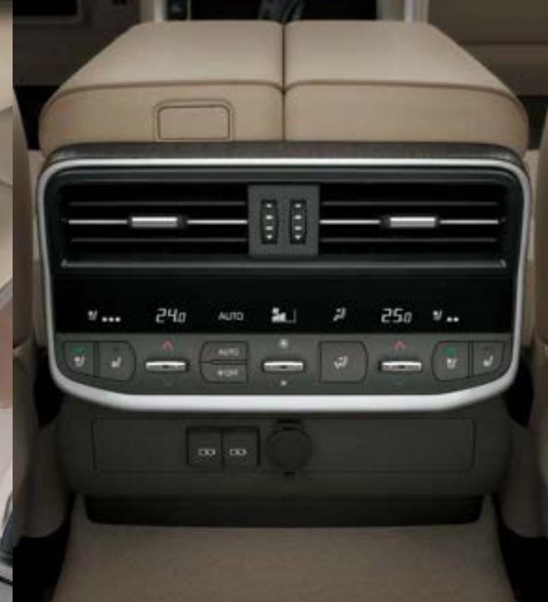
Rear Climate Control