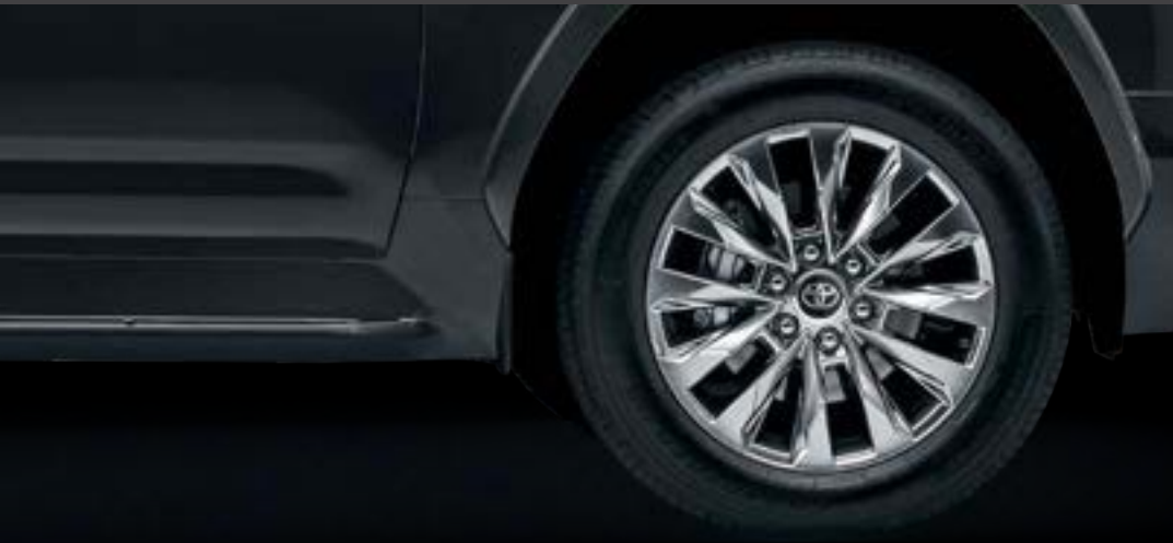
20" Alloy** Wheels

Whether you're travelling cross-country or battling in the bush, there's absolutely no doubt that the Land Cruiser 300 is engineered to handle the hard stuff, while keeping you comfortable and in control.