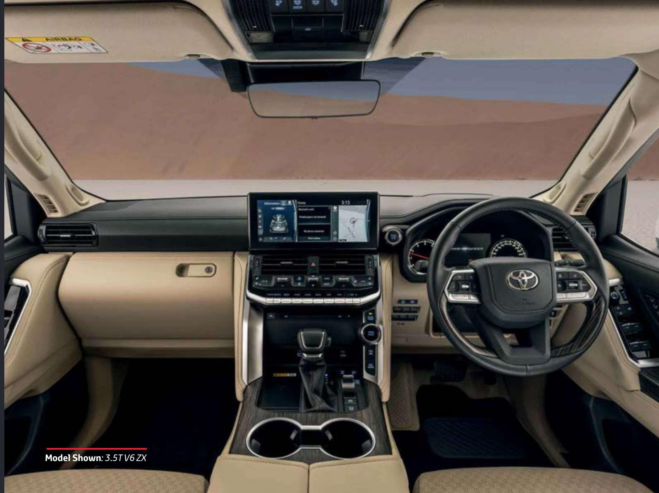
Model Shown: 3.5T V6 ZX