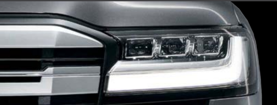
LED Adaptive High-beam System* and Daytime Running Lights