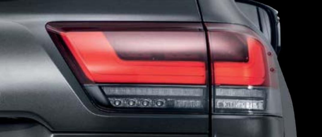
Rear LED* Lights