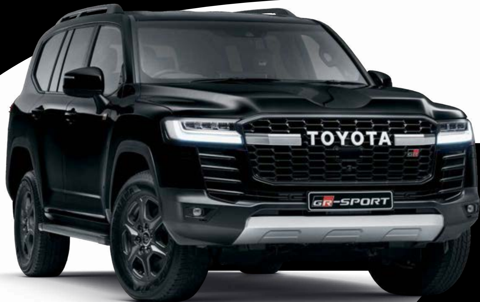
Model Shown: 3.3D V6 GR-S