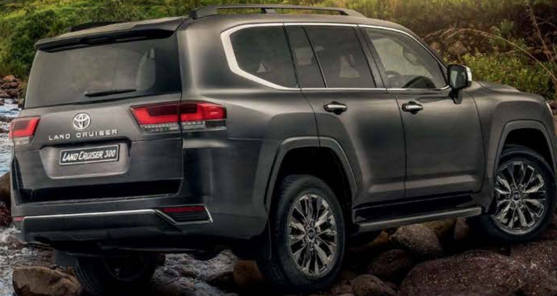
Model Shown: 3.5T V6 ZX